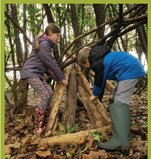
Engage with the outdoors