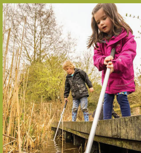
Explore our wild places

An exciting range of school programmes and activities Foundation & Key Stages 1 - 5