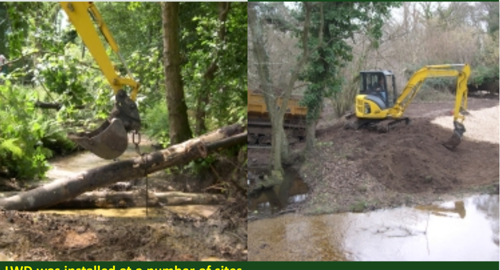
LWD was installed at a number of sites to raise riverbed levels and create additional habitats in the channel.

A new channel was excavated and river re-profiling carried out.