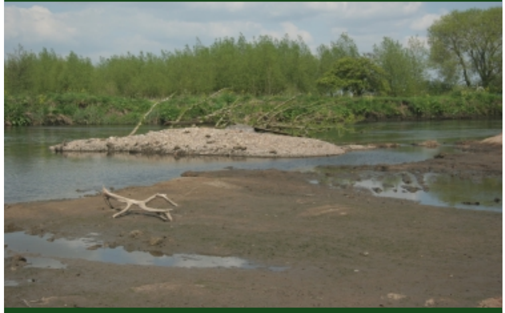
May 2010. A view of one of the newly created river islands - note the leaves.

Several new willow river islands were created within the widened channel. (i) a scrape was excavated in the river substrate, (ii) live willow trees were placed into the scrape with their root plates facing in an upstream position, (iii) clay and gravels were placed on top of the LWD, (iv) ...and the island is left to develop and strengthen naturally as the willow grows adventitious roots into the river bed.