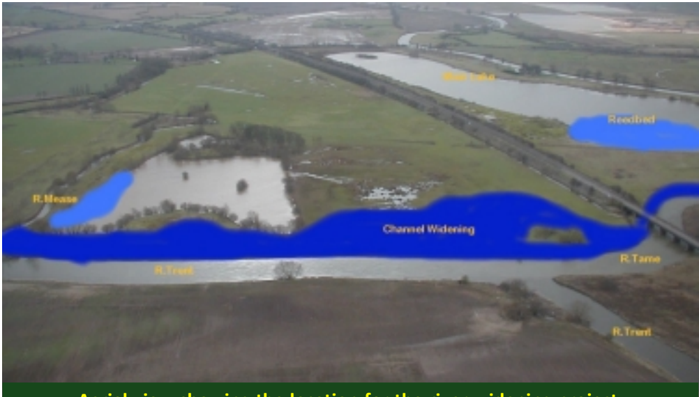
Aerial view showing the location for the river widening project.

More info: www.staffs-wildlife.org.uk/page/river-braiding-reedbed-creation