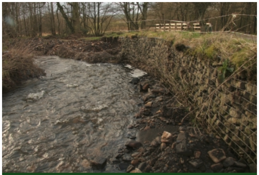
View of the collapsing gabions in 2008

The scheme was carried out in the summer of 2009. Baseline surveys of fish, vegetation, geomorphology, mammals, macro-invertebrates and stream corridor Diptera (true flies) were commissioned prior to undertaking the works.