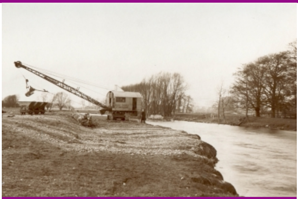
Gutted. The Trent River Catchment Board carrying out routine maintenance along the River Dove in the 1940s using a drag line. Notice the LWD removal and the creation of a trapezoidal channel.