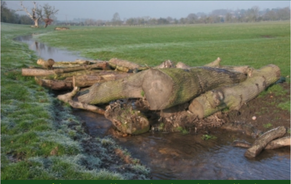
One of the constructed log jams along the newly diverted brook.