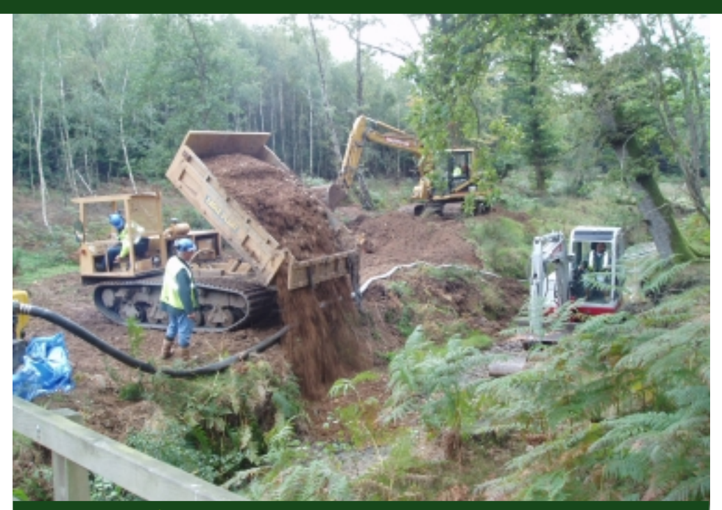
Life3 scheme at Highland Water to raise bed levels.