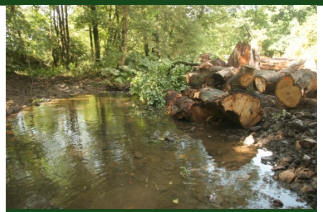
View of the completed ELJ and the entrance to an old side channel.