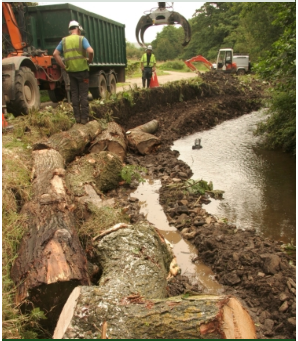
August 2009. The gabion baskets were removed and replaced with living, sprouting willow trunks.

More info: The reports relating to this scheme can be viewed at: www.staffs-wildlife.org.uk/page/tittesworth-woody-debris-project