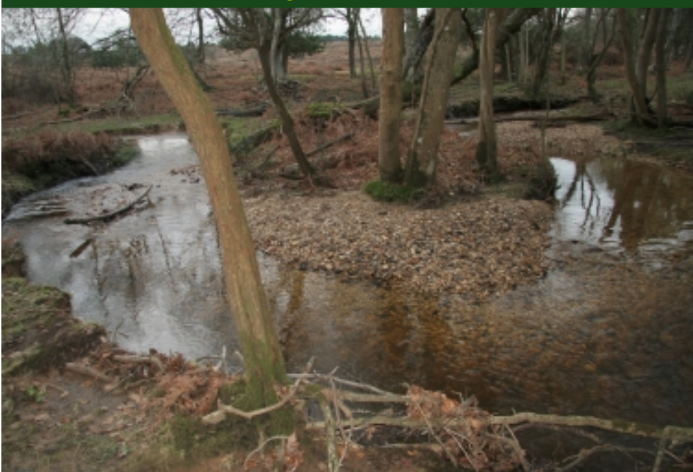
Highland Water after the restoration works.