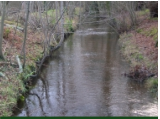
Dockens Water in 2004 shortly before the project was undertaken.