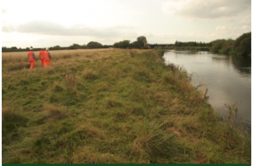
September 2009. The River Trent at Croxall prior to the works.