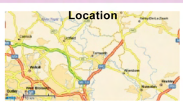
Tamworth is situated to the north-east of Birmingham. It is easily accessed via the M42 from the east or the A5 from the west.